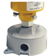
Low Surface Mount No frangible coupling