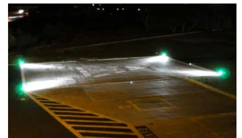
Surface floodlights provide uniform lighting without glare