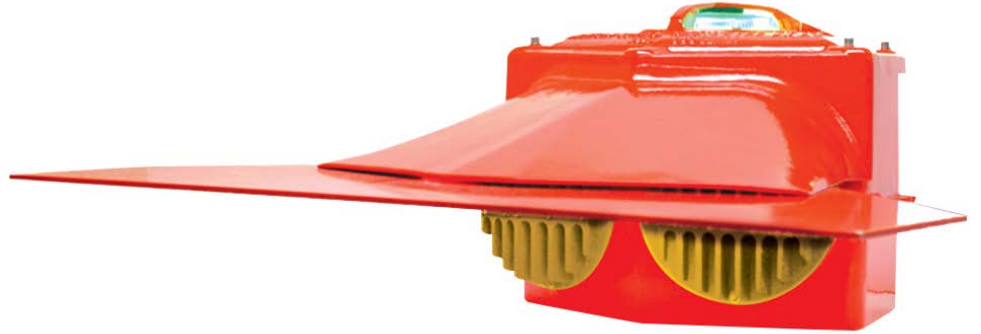
Model 702 LED

Our dimmable floodlights provide uniform lighting without glare. The low vertical beam, combined with a new cover extension design, and a brightness control knob, prevents blinding of the pilot and crew. The LED lamps can-