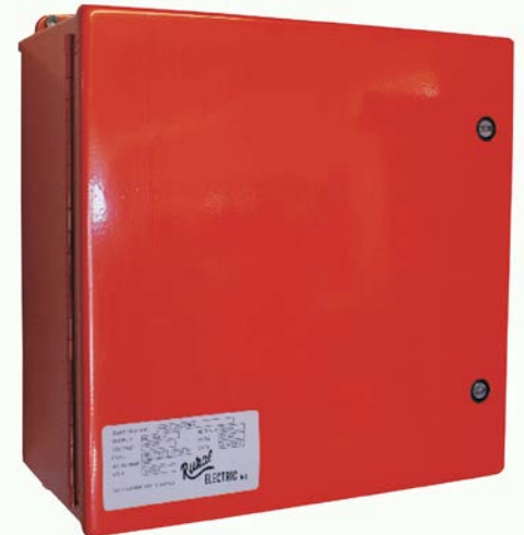
L-854 Radio Receiver/Decoder (P/N: 47-RDL854-1A)