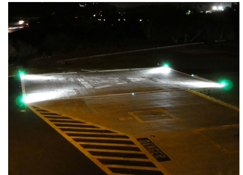
Surface floodlights provide uniform lighting without glare

control knob, prevents blinding of the pilot and crew. The LED lamps cannot be seen, even when standing in the center of the pad (proper aiming of the floodlights is necessary).