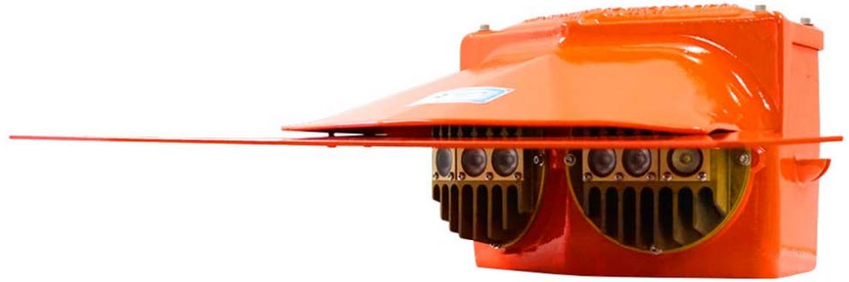
Model 701 LED

Our dimmable floodlights provide uniform lighting without glare. The low vertical beam, combined with a new cover extension design, and a brightness