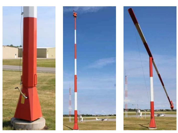
Optional Beacon Tipdown Pole