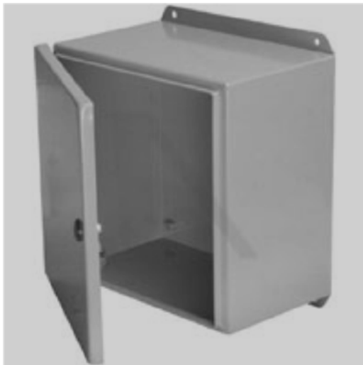
Enclosure Showing Mounting Tabs